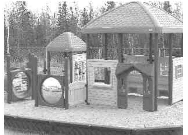
New playground equipment which was added to compliment the new infants and toddlers program.

The second annual ABC to Development screening session will be offered on Saturday May 14th from 9:00 a.m. until 3:00 p.m. Parents will have the opportunity to have their children, between 18 months and 5 years of age, assessed with respect to their development.